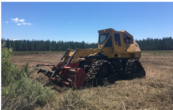
Elk Flat where trees and brush has been removed and shredded (masticated) along with the equipment used—the masticator