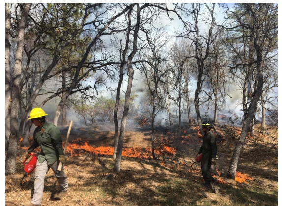
March 2021 burn on the Stone Pitts property near Greenhorn Creek in Yreka

Recent fires are an important reminder of the urgent need to proactively manage our landscapes.