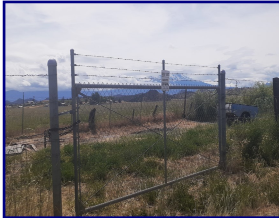
Grenada wastewater treatment pond near the east edge of the town of Grenada. Grenada is under a no-growth policy until a solution can be found for this antiquated system which is at its practical operational limits.