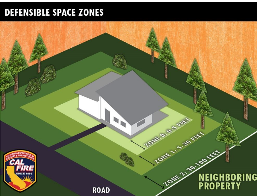
Map of Zones:

Zone 0: 0-5 ft: Nothing flammable can be within 5 ft of the structure. Trees, shrubs, wood chips, grass, etc. Zone 0 extends 5 ft beyond if there is an attached porch.